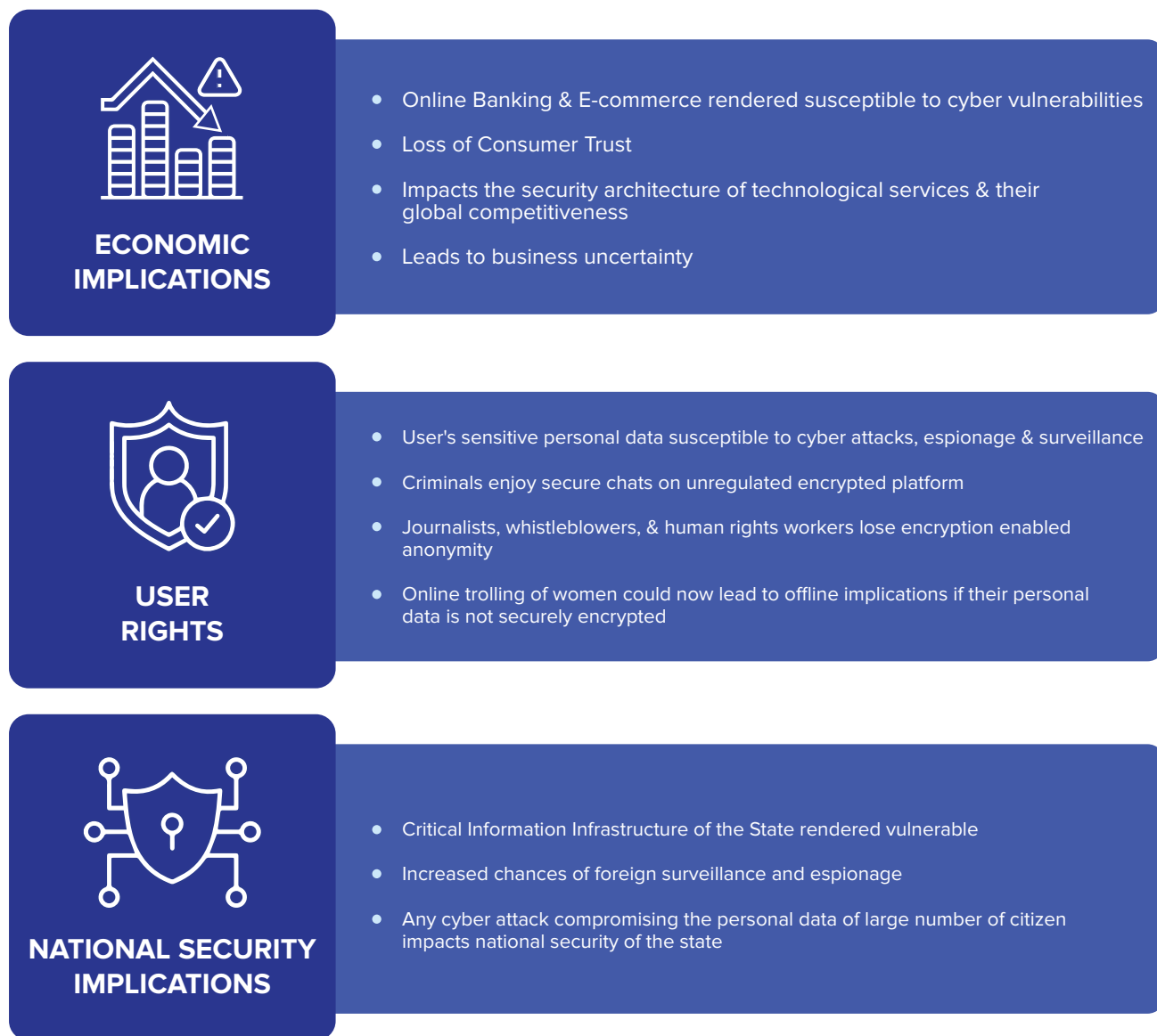
FIGURE 5: RAMIFICATIONS OF BREAKING ENCRYPTION 42