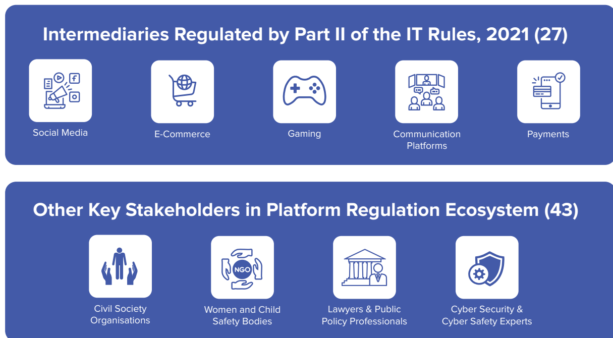
FIGURE 2: STAKEHOLDER DESIGN

The research team relied on maximum variation sampling within purposive sampling to seek primary inputs from a diverse set of stakeholders impacted by the IT Rules, 2021 by utilising three mechanisms to seek inputs from a total of 82 stakeholders, out of which 70 inputs were received on Part II of the IT Rules, 2021. The stakeholder distribution on Part II includes: